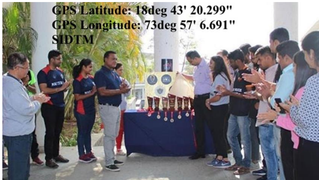
Figure 4: Sports National Event GRUDE for Prize Distribution Ceremony