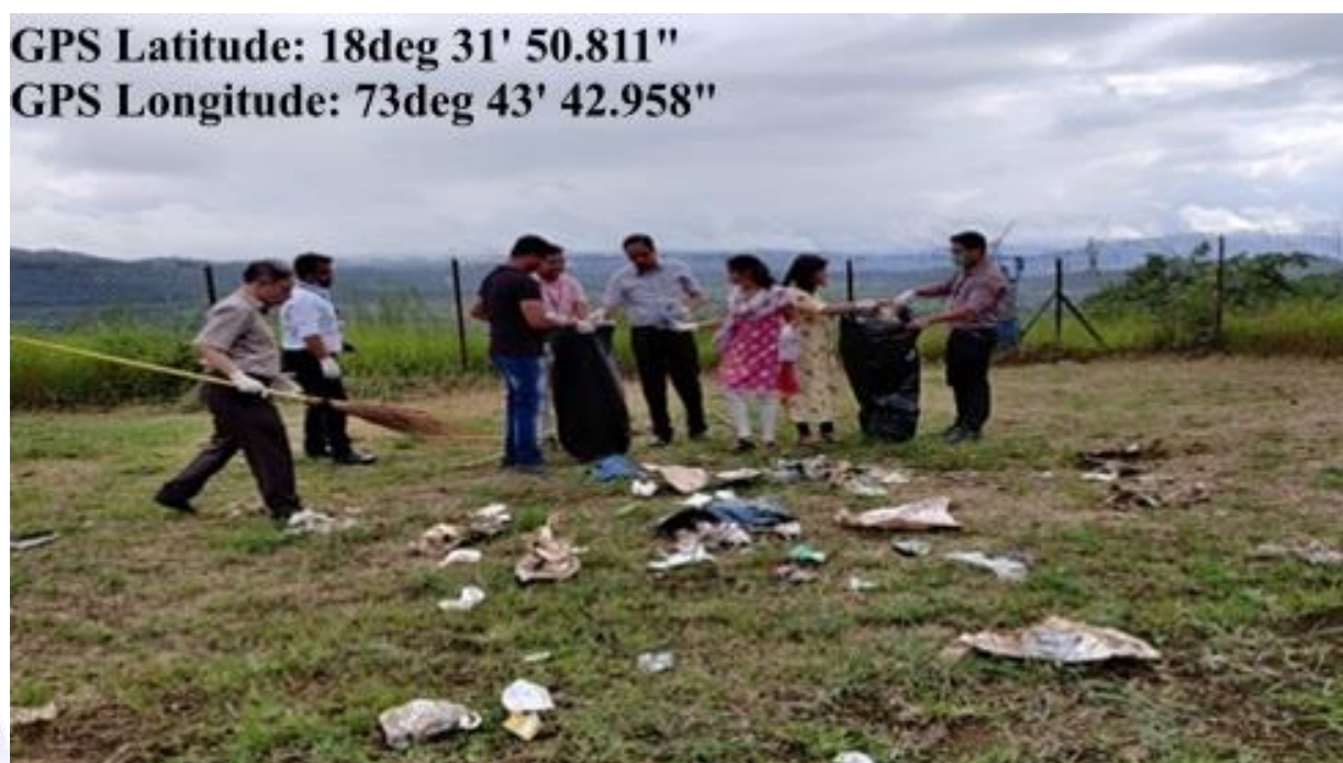
Figure 11: Clean Up Drive: Swachhata hi Sewa.

Key Learning: Being green and clean is not just an aspiration, but an action. In our efforts towards making our campus cleaner and more hygienic we learnt that with cleanliness in our surroundings we can keep ourselves germ free and hygienic, which will make us healthy and strong.