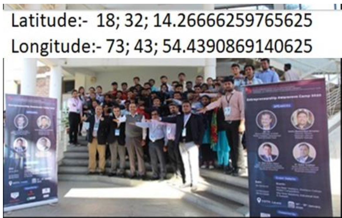
Figure 12: ENTREPRENEURSHIP AWARENESS CAMP

Detailed Event Report: Keynote sessions from eminent personalities associated with banks, MSMEs, start-ups and MNCs enlightened the students from various colleges about their journeys and motivated them by sharing valuable insights in the entrepreneurial arena. In addition, a business model competition and an industrial visit was also organized to provide a practical blend to the young minds wanting to fulfil their dreams. Key Learnings: The three-day journey exploring the opinions and interpretations by the honourable dignitaries helped the students to develop a new perspective towards Entrepreneurship. They focused on what the Entrepreneurial future would be like and the financial aids available to pursue a successful career in this arena. Impacts with proofs attached: 56 students attended the second edition of the EAC camp organized by the SIDTM out of which 27 students were SIDTM students and 29 were external students.