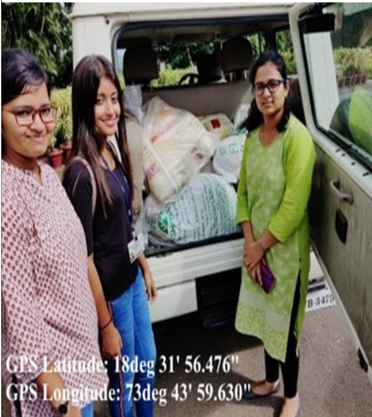
Figure 8: AASHECHA KIRAN'' -FLOOD DONATION DRIVE'19 - Donations made for the flood victims by team