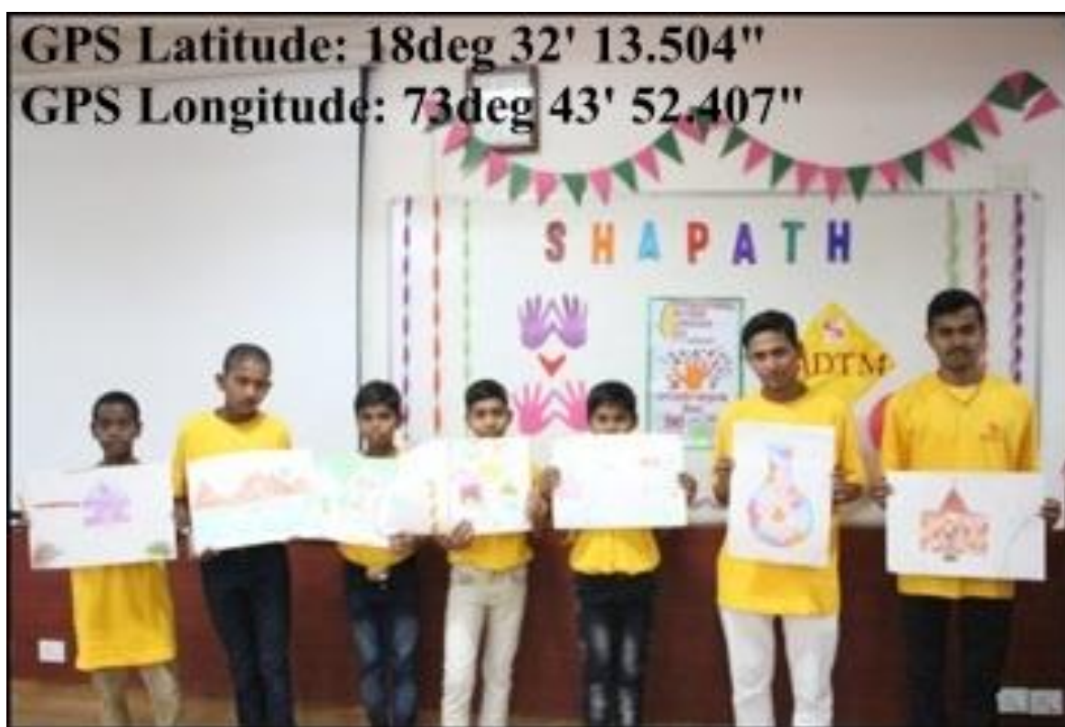
Figure 14: SHAPATH”- ANNUAL PROGRAMME OF NGO HOMECOMING

Timing: 9:30 a.m. onwards with Event Objective: To facilitate a day of fun and learning for children of underprivileged background, as well as giving them an exposure to different cultures throughout India. The main aim of the activity was to provide the children from SPARSH BALGRAM a day of joy, by allowing them to participate in singing, and drawing competitions, and giving them a glimpse of the beautiful Lavale campus, creating memories for the children and the participants in the process.