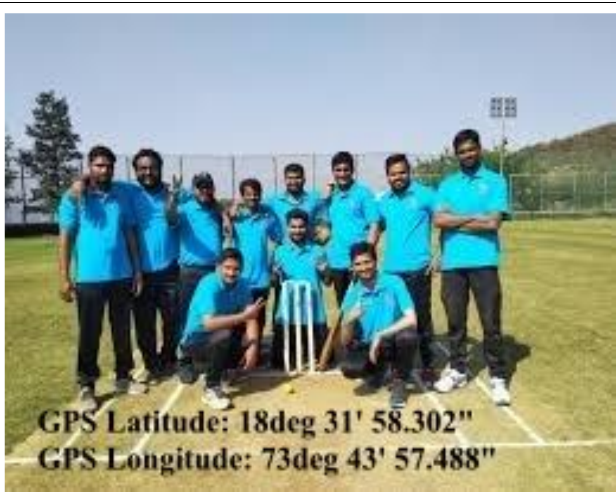
Figure 2: Cricket Team- Sport Event