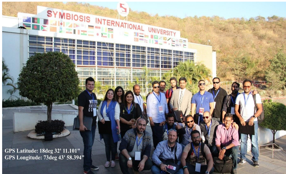
Figure 6: International Study Tour : A CULTURAL EXCHANGE

SIDTM (Formerly SITM) had conducted Business Analytics and Research Methodology classes for a delegation of Executive MBA.