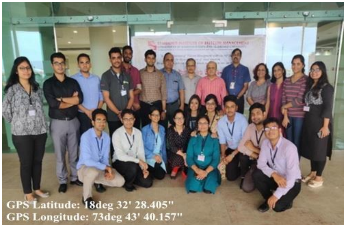
Figure 7: Blood Donation Camp