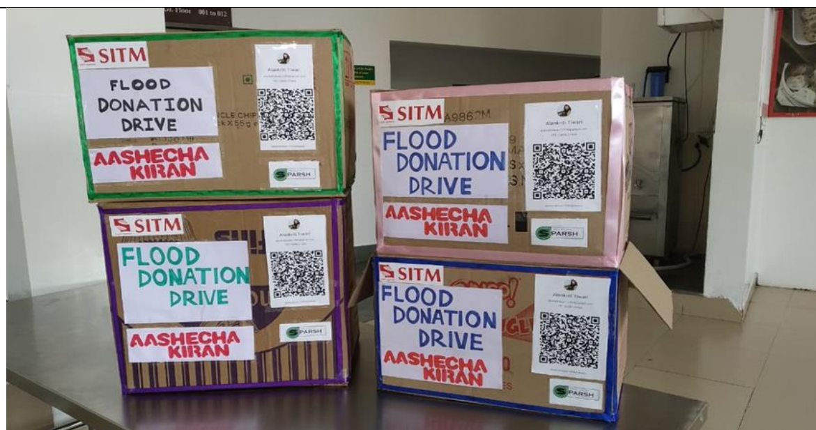
Figure 9: Donation boxes prepared for the Flood Donation Drive