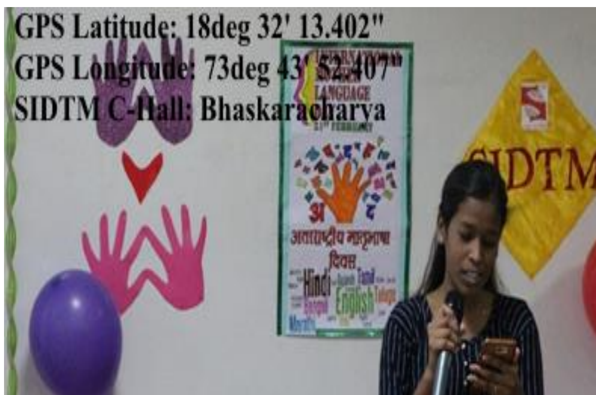
Figure 16: Celebration of Marathi Bhasha Gaurav Din at SIDTM

Key Learning: "MATRIBHASHA DIWAS" helped to showcase the linguistic diversity of the country, as the date is recognized as "International Mother Language Day" by the UN.