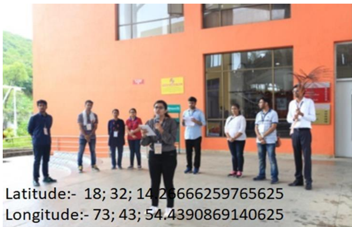
Figure 3:Play on Water Conservation during e Camp