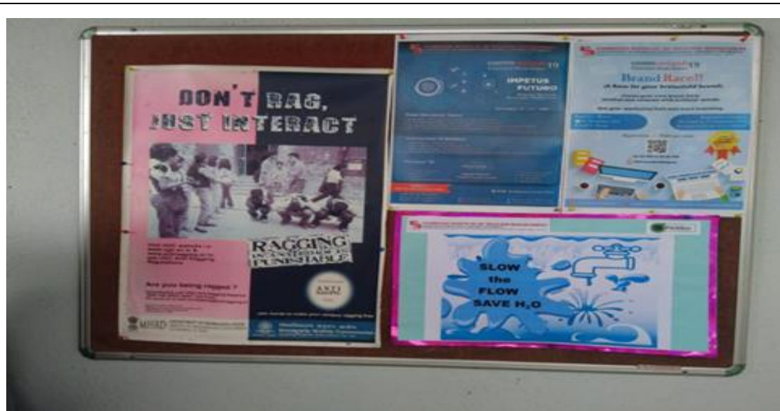
Figure 2:Water Conservation during e Camp