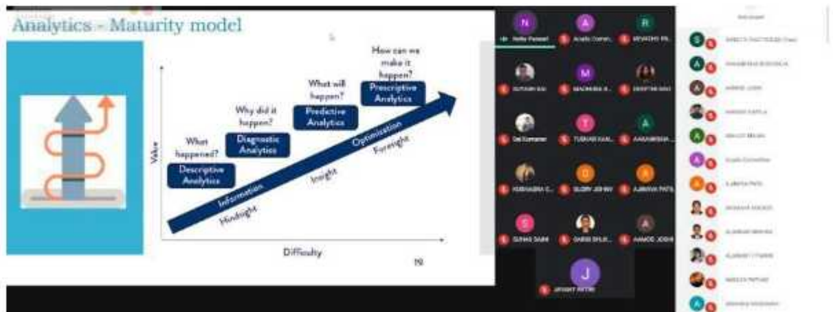
Screen Shots of the On line Session