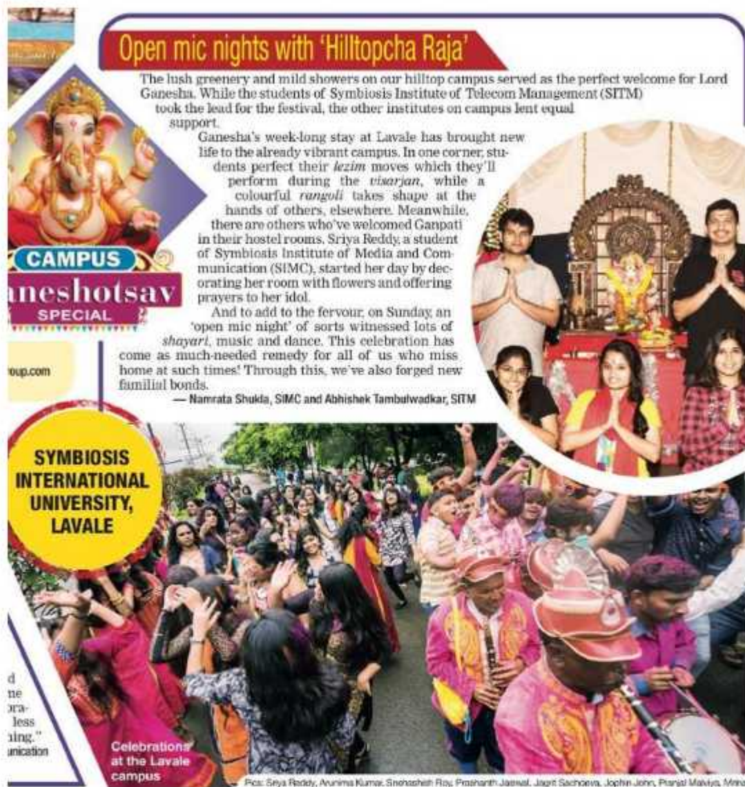
Figure 1: Ganesh Utsav

Ganesh Chaturthi, 25 th Aug 2017 to 5 th Sept 2017, also known as Vinayaka Chaturthi is one of the important