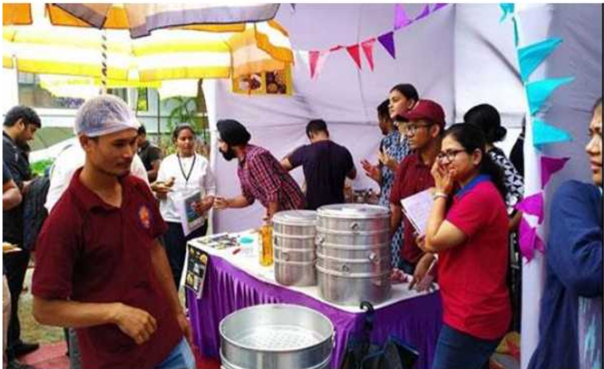
Figure 12: Fun and Food Fest: Collection for Donation

As SPARSH aids the ISR, we look to help the local villages and communities and this event is for a social cause to business. S.P.A.R.S.H- the ISR wing of SITM, organized an event - FUN AND FOOD CARNIVAL 2017 on September 11, 2017. This event was organized to help students in showcasing their entrepreneurship skills for a day by means of setting up Food and Fun stalls while serving a noble cause. Profits generated in this event were donated in the form of charity to the underprivileged.