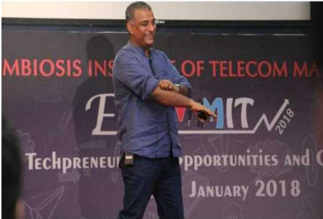
Figure 5: E SUMMIT EVENT

An entrepreneurial conclave, that aims at manifesting the latent entrepreneurial spirit among the young students, under the name 'E-Summit' has been initiated by Entrepreneurship cell in 2017. SITM organizes the event annually so as to provide a meeting ground for corporate and young budding entrepreneurs. This year E-Summit'18 was scheduled on 20th January 2018 consisting of two keynote speeches and one panel discussion.