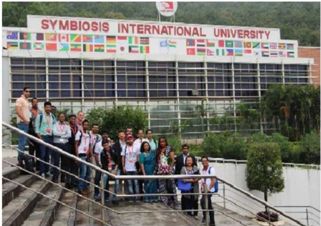
Figure 4: International Study Tour : CULTURAL EXCHANGE

SIDTM (Formerly SITM) had conducted Business Analytics and Research Methodology classes for a delegation of Executive MBA.