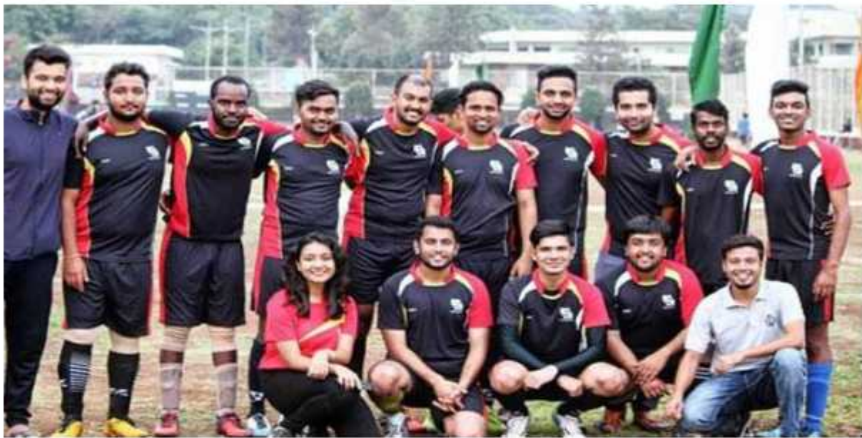
Figure 8: Sports Football Team for Grudge event 2018