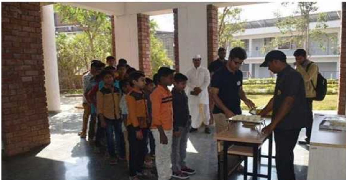
Figure 11: ISR activity and Homecoming of NGO

The theme of the event was, Stop enlighten little smiles. The event was conducted with the purpose of welcoming children from the orphanage so that we can be a part of their world for one day and so that even they get to carry back some beautiful memories. As many as 20 children in the age group of 10-14 years participated from Maher Ashram, Pune. They were taken for a tour around the lush green Lavale campus.