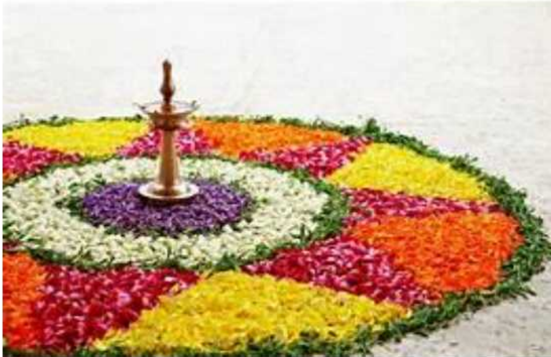
Figure 9: Onam Celebrations

And Celebrate Onam with decorations, Food and Festivities. 15 th Jan is declared holiday for Makar Sankranti.