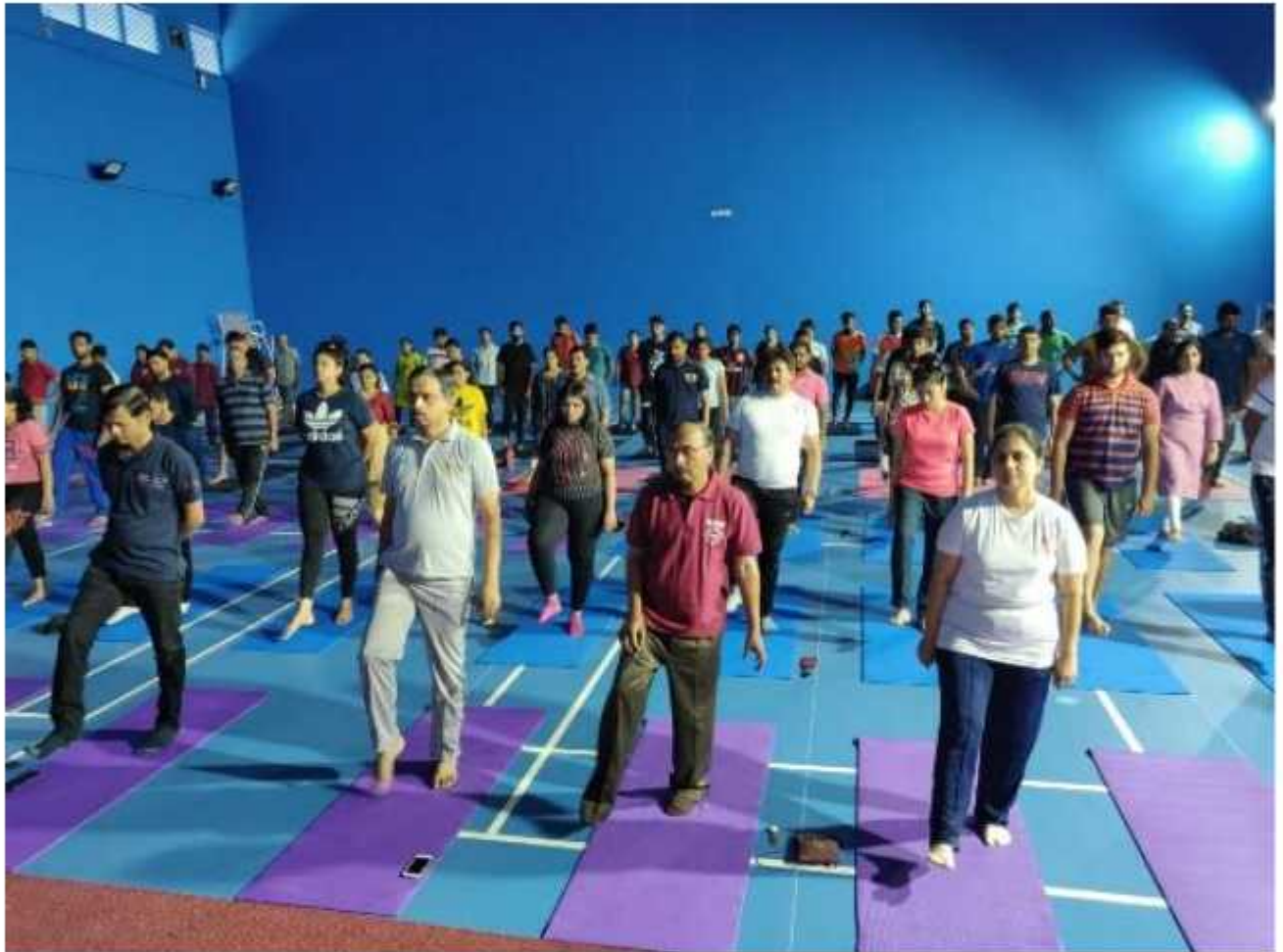
Figure 7: Yoga Day Celebration 2017

Date 21st June 2017. Venue: Sports complex. We had Attendance: 12 Faculty and Staff members and 15 students.