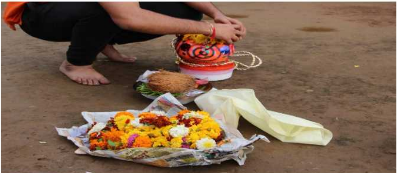
Figure 10: Making of Dahi Hanhi at SITM

One form of celebrating the deity's birth is dahi handi which is mostly celebrated in Gujarat and Maharashtra. Boys get together to form human pyramids to break an earthen pot which is fixed at a height of about 30 ft from the ground.