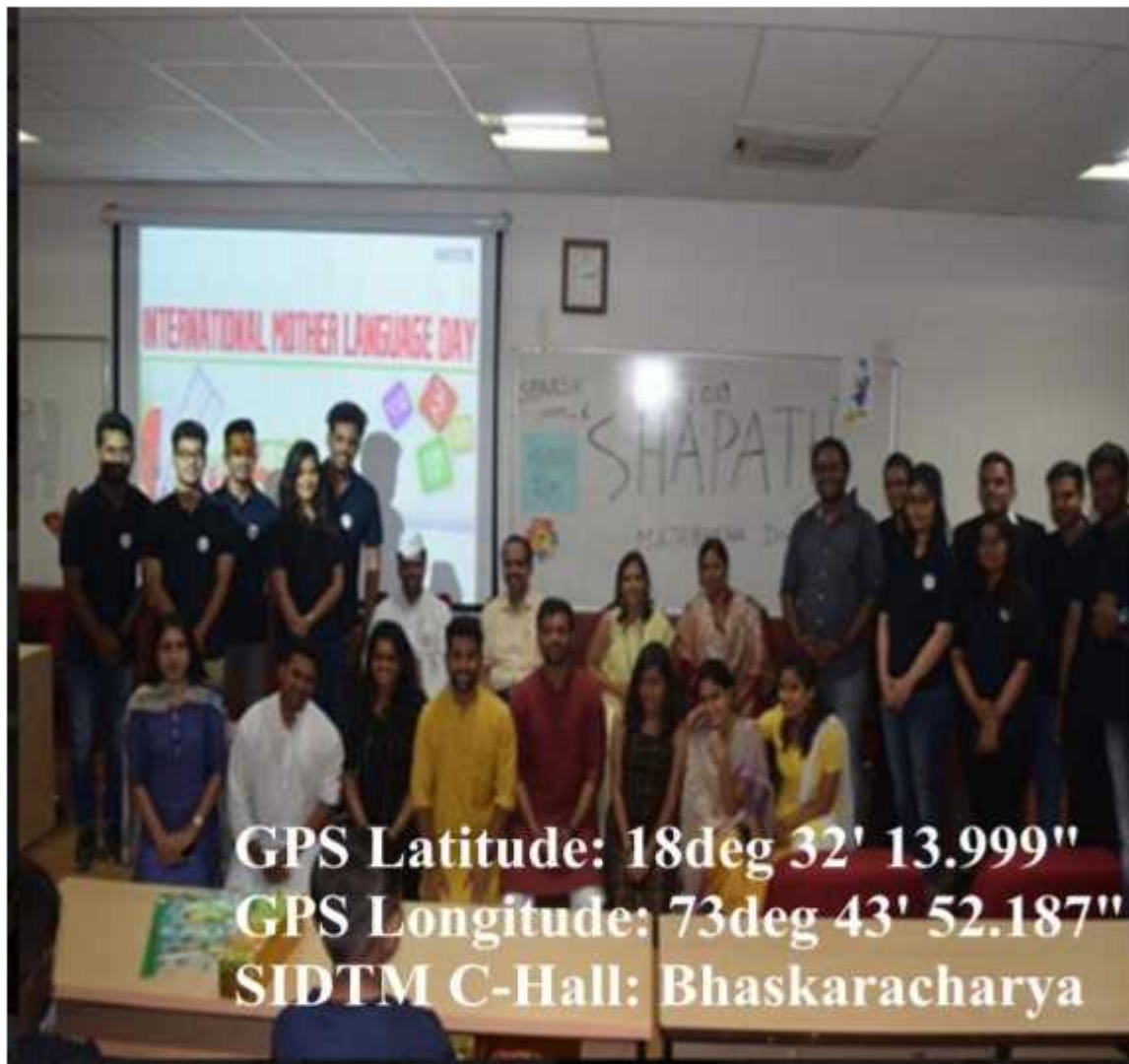
Figure 10: FO Shapath event