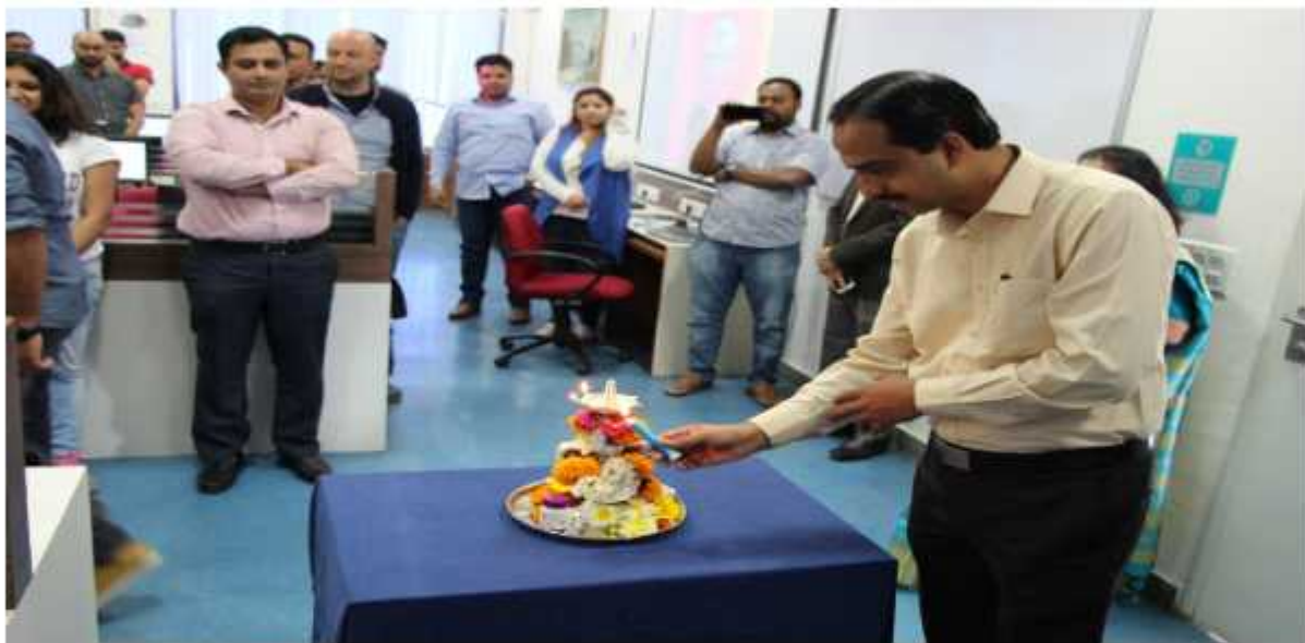
Figure 2: International Study Tour: CULTURAL EXCHANGE

International Study Tour held June 2018, Oct 2018 and Jan 2019. And had conducted Business Analytics and Research Methodology classes for a delegation of Executive MBA.