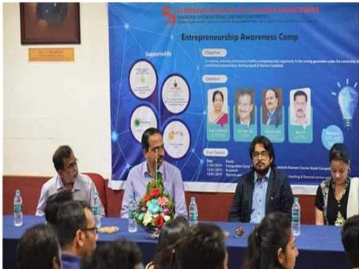
Figure 4: ENTERPRISE AWARENESS CAMP

This was the platform to the students from backward section of the society to uplift their self-awareness regarding entrepreneurship and financial aids available. S.P.A.R.S.H- the ISR wing of SITM, organised the Event- "ENTREPRENEURSHIP AWARENESS. CAMP", from 11th-13th January 2019 at C-hall. EAC provides a platform to the students from backward section of the society to uplift their self-awareness regarding entrepreneurship and financial aids available. the schedule for the event. 11th January: Address by Entrepreneurs, Business Model Canvas Competition (BMC). 12th January: E-Summit 2019. BMC prize distribution. Industrial Visit. 13th January this was Address by prominent bankers and investors.