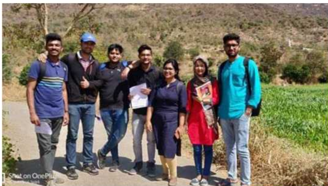
Figure 7: UNNAT BHARAT ABHIYAN SURVEY-2019