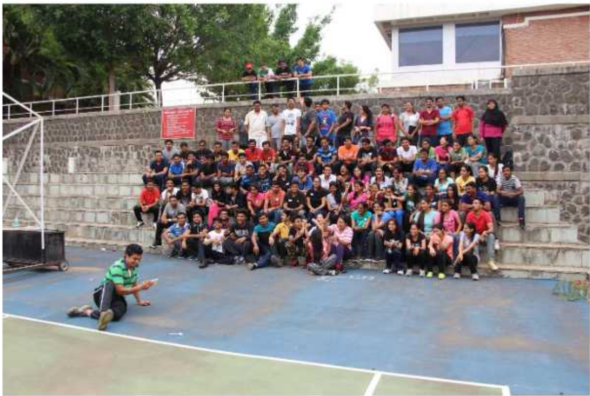
Figure 6: National Sports Event (SPORTS @ SITM) Grudge