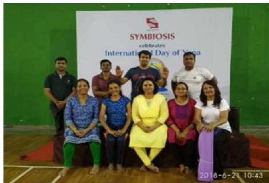
Figure 5: Yoga Day 2018

The origins of yoga are described in mystery and mythology, some historians find many clues in the practices of Himalayan Shamans as still seen in Tibet and Nepal. The Lord Shiva is considered the father of ancient yoga while some historian says that Patanjali is the father of modern yoga. Foreign countries are also following Yoga religiously as they have understood importance of Yoga and the benefits it provides.