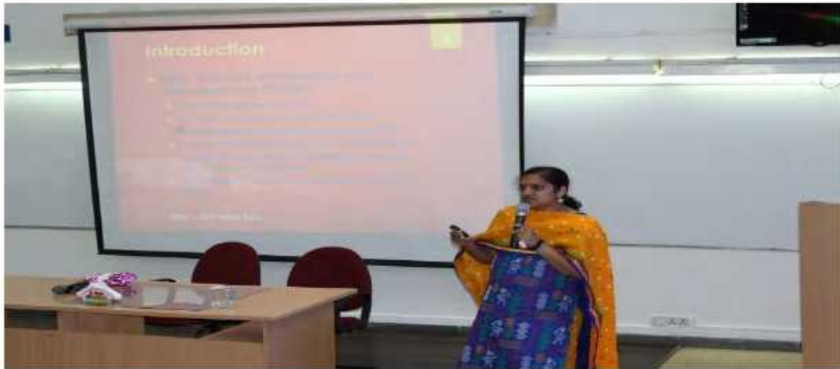
Figure 1: Gender Sensitization Session