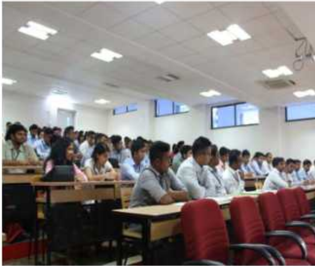
Figure 3: Induction Orientation