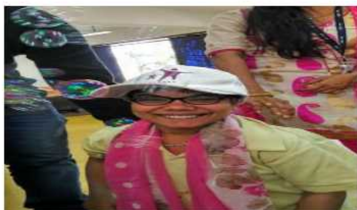
Figure 8: Homecoming 2016