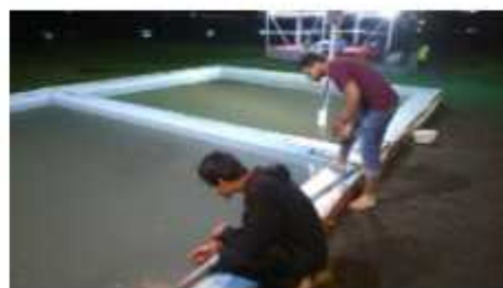
Figure 13: Cleanliness Drive- Ganesh Visarjan

In India, river pollution has crossed the mark of crisis and generally on the occasion such as Anant Chaturdashi there is visarjan of Ganesha idols and garlands by people in the river basin which pollutes the river to a large extent. Adhering to this concern S.P.A.R.S.H team comprising of 9 members from SITM visited the river “Mula Murtha” under the Z bridge on 15th September 2016. Our team segregated the garlands and puja samagri from other visarjan material in nirmalya kundi, plastics bags were also separated and collected in different dustbin as well people were advised to do ganpati visarjan in the artificial water tank instead of the river. S.P.A.R.S.H team collaborated with another NGO named Swach to work for this Nobel cause. Awareness drive was carried out on the river bank to educate people about deterioration in the water quality of the river caused by murti visarjan and people were recommended that from next year instead of murti visarjan the idols can be donated. We hope our small effort one day makes a big impact on the minds of people and leads to environmental conservation in the long run.