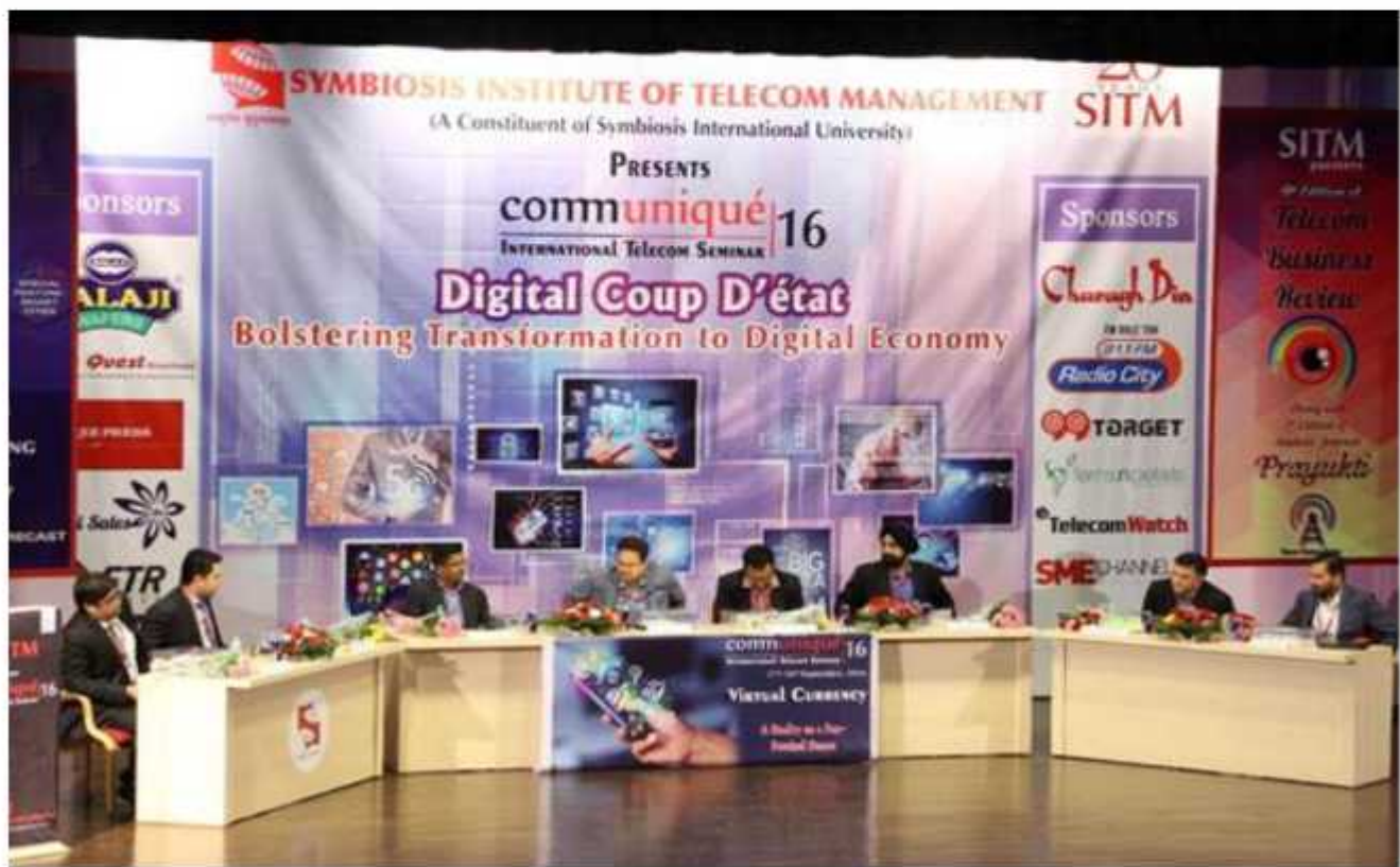
Figure 4: Communiqué Panel Discussion

It is held every year in the month of September Communiqué is an enormous platform for networking and exposure. It is the ground of collaboration of experts and the amateurs of the next generation in large numbers. Communiqué has been successfully standing up to the expectations of the industry over the past 20 years, all thanks to the help of our sponsors and partners.