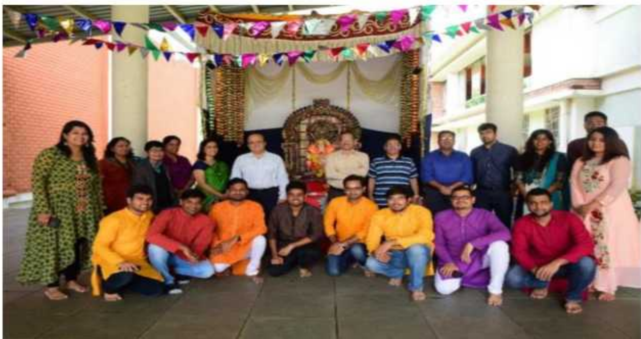
Figure 1:Ganesh Utsav

There were major arrangements that were done mainly by SITM teams and all the campus from various other institutes also joined in the pooja.