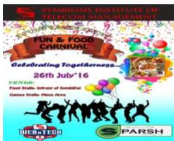
Figure 10: Fun and Food – Donation of Profits to needy

They will provide food item the stalls and the profits generated from the activities will be donated to the underprivileged to the villages we associate due to our location and relations. The event took place on at SIU campus. On one hand it teaches them entrepreneurship and on the other hand teaches them the social responsibility. The profit generated out of this is donated to various NGOs over a period