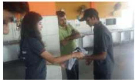
Figure 14: Light a lamp - Diwali with SIU Mess Staff

It's always great to spend occasions like Diwali with our loved ones. Our family, relatives, friends. But not all enjoy this. Few men & women day and night work putting forward their duty first. SITM acknowledges and respect the dedication and passion shown towards work. Such an example is of SIU Lavale Hill top Mess workers. Few are not in hometown due to financial crunches, some have no families to celebrate with and for some duty is ahead all. SITM admires this spirit and hence SPARSH team spend Diwali Dhanteras with the Mess Workers. Pending profits from fun and food 2016 were utilized to give 65 mess workers new clothes (T shirts) and sweet. We exchange greetings, wishes and spend quality time with them.