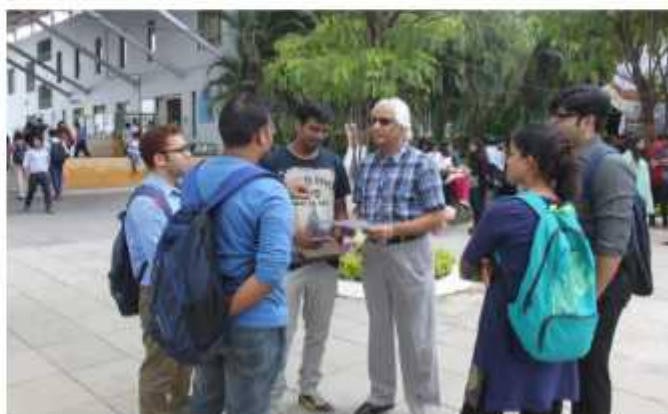
Figure 11: Fun and Food Carnival