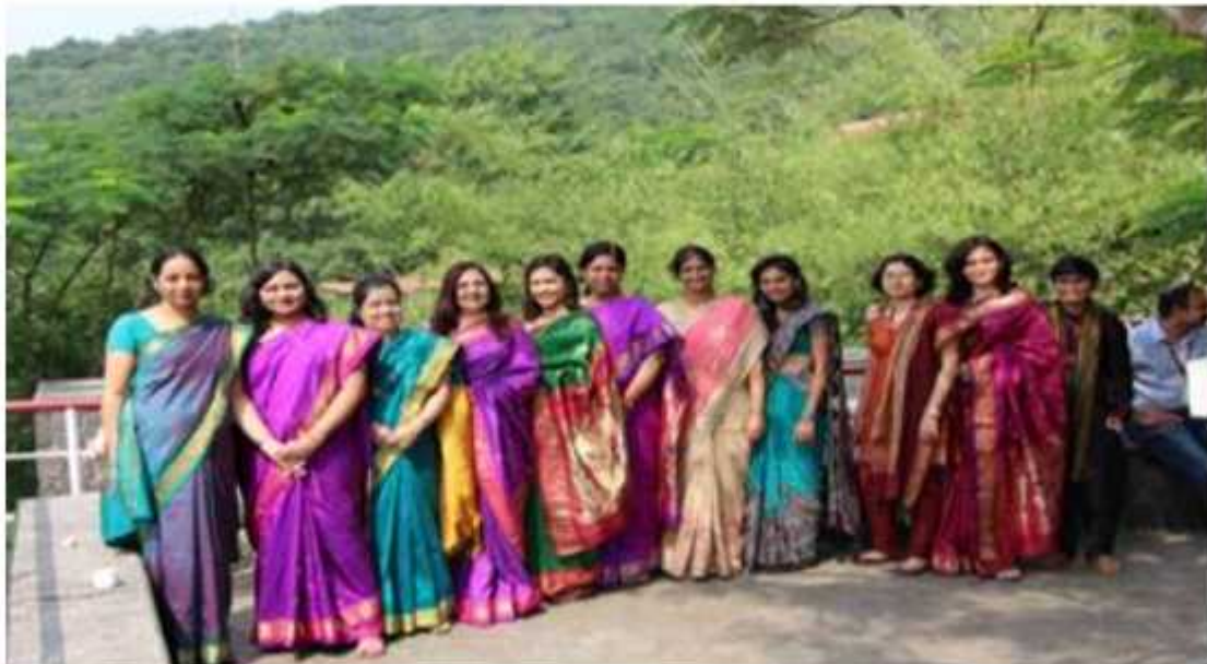
Figure 2: Makar Sankranti celebration by Staff

This is celebrated by all the women in the institute by gathering together and sharing a meal. We also have Haldi Kumkum celebrations on 23 rd Jan 2017. This event is used to sharing life experiences and unity in the workplace.