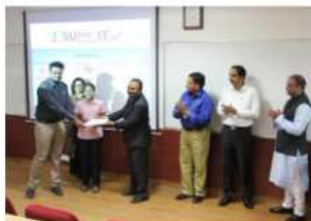
Figure 12: Social Business Plan Competition “UMEED”.

India is making strides in the world as a nation with encouraging developments in scientific, economic and technological fields, but as far as social developments are concerned, it is still behind other countries of the world. S.P.A.R.S.H., the Institute Social Responsibility arm of SITM has always engaged in activities that serve the society in some form or another and put in its best efforts to create awareness about our responsibilities towards the society. Carrying forward the same spirit, S.P.A.R.S.H took one more step by providing an excellent platform for management students from all over the country to showcase their talents by giving them an