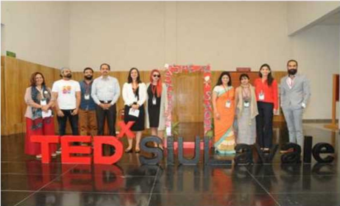
Figure 5: TEDxSIULavale (x = independently organized TED event) Theme: Stand. Speak. Show.

Zubin is the founder of Atré Yoga, an innovative method that successfully integrates yoga into contemporary lifestyle, combining a scientific approach to human anatomy with ancient yogic and traditional meditation techniques.