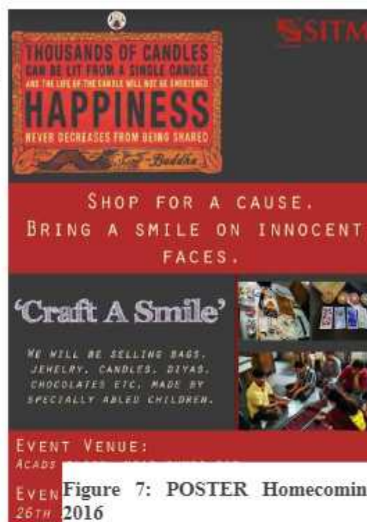
Figure 7: POSTER Homecoming 2016