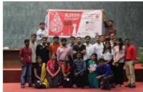
Figure 6: Blood Donation Camp