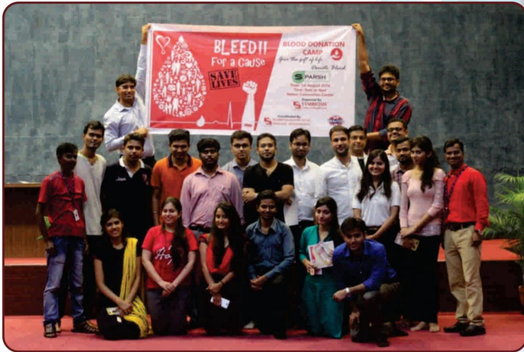
Blood Donation: Save lives!

Institute Social Responsibility Team Symbiosis Institute of Telecom Management (SITM) (Constituent of Symbiosis International University) Symbiosis Knowledge Village, Village Lavale, Mulshi Taluka, Pune-412115 http://sitm.ac.in/sitm-corner/committee-details/sparsh-committee.html https://www.facebook.com/Sparsh.SITM