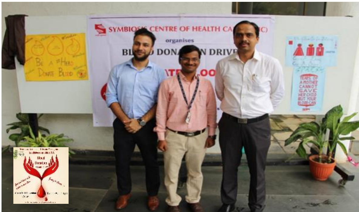
Figure 1: Blood donation Camp

On 31st July 2017 the drive was organized in collaboration with SCHC. The Blood Donation Drive was organized by SCHC and was carried out with a lot of enthusiastic individuals who came forward to