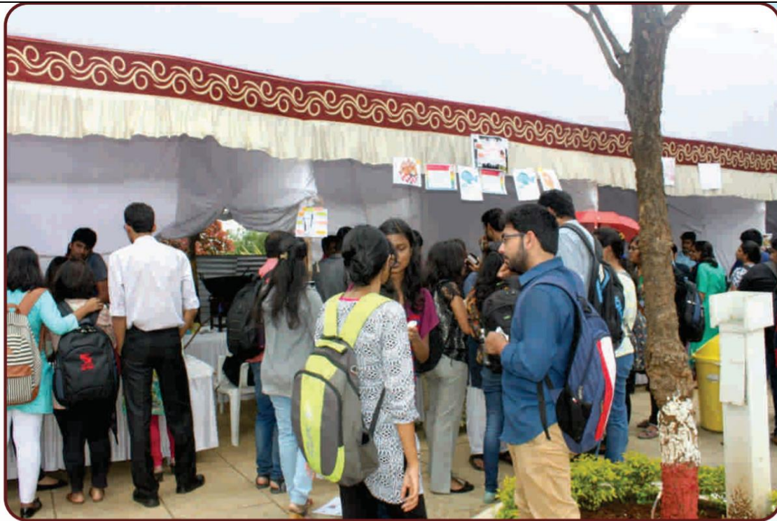
Fun and Food Carnival: For "Chotu" at every tea-stall and for his dreams