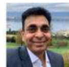
Purushottam Kaushik Head, Centre for Fourth Industrial Revolution, India World Economic Forum